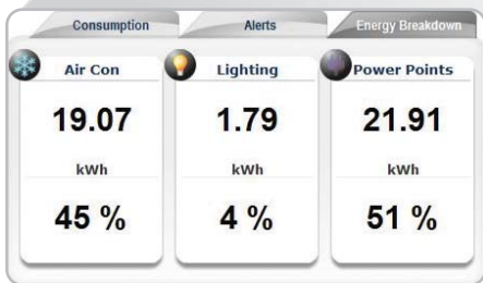
Energy Breakdown – Provides a % breakdown of energy usage by different load types and helps you understand and identify where energy saving initiatives should be focussed on.