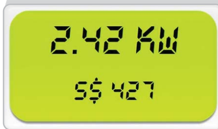
Real Time Energy Monitor (RTEM) – Displays your power usage in real time and how much it would cost per month to keep the same energy usage profile. The RTEM intelligently 'learns' your energy usage pattern and changes from green to red depending on whether you are using above or below your monthly average, providing you with another visual cue to understand your energy usage.