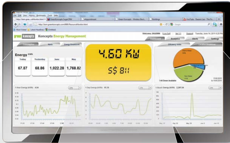
Energy Dashboard – Provides a real time view of the energy consumption in your office or building.

With powerful energy intelligence functions such as charting, benchmarking as well as drill down and zoom functionality, Koncepts Envision equips you with the ability to see and identify trends, usage patterns and seasonality factors. This in turn enables you to investigate and identify energy saving opportunities as well as implement effective energy policies.